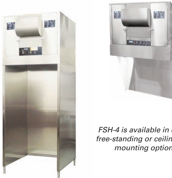
FSH-4 is available in either free-standing or ceiling/wall mounting option.